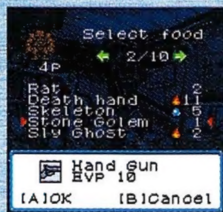
PREY SELECTION SCREEN